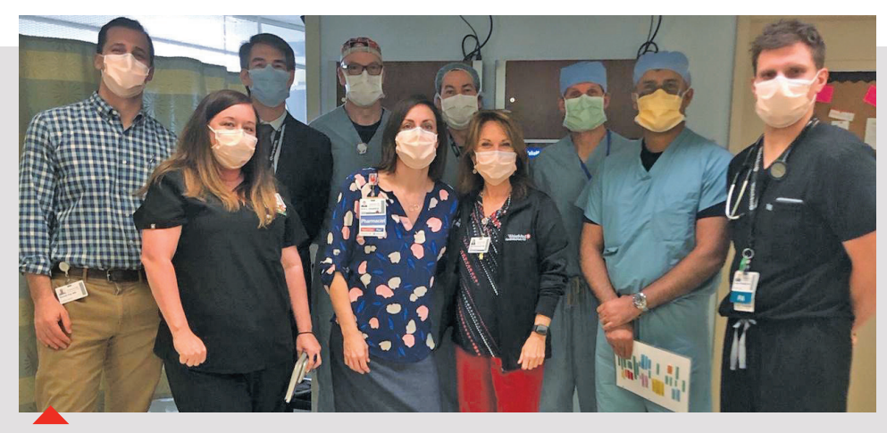
The WakeMed ECMO team debriefs after the first VV ECMO case was performed in April.

In February, the neuro thrombectomy implementation team at Cary Hospital gathers together after months of hard work, training and preparation.